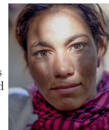
*Name changed and image used for representation only