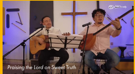
Praising the Lord on Sweet Truth

Sweet Truth is a new series for Afghan Christians and seekers on SAT-7. Including worship, teaching and a children's slot, the programme offers encouragement to viewers facing intense pressure. Pray that this programme will bear real spiritual fruit among Afghan viewers.