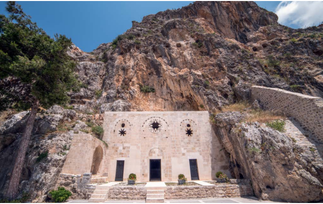
The Church of St Peter, one of the world's oldest churches, in Antakya (Antioch), Türkiye