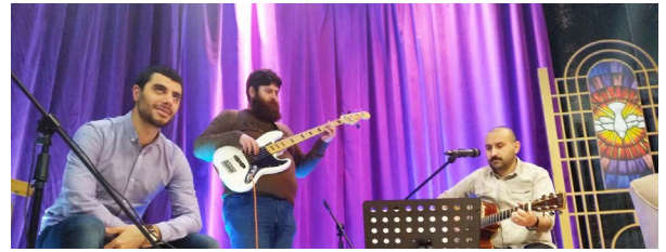
On the set of SAT-7 TÜRK programme, Let's Talk

It is also an opportunity to celebrate the different cultures in the country; the customs of Armenians and Greeks are different from each other, while Turkish Christians have their own customs. Churches even use different words for "Christmas";