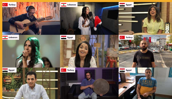
SAT-7's international recording of Silent Night - available on the Advent resources page

Or you could show our international video version of Silent Night, available on the Advent website.