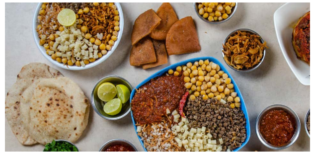
Traditional Egyptian foods, including bread, chickpeas and lentils

Christmas is a time of giving where many donate to the church and its affiliated organizations to