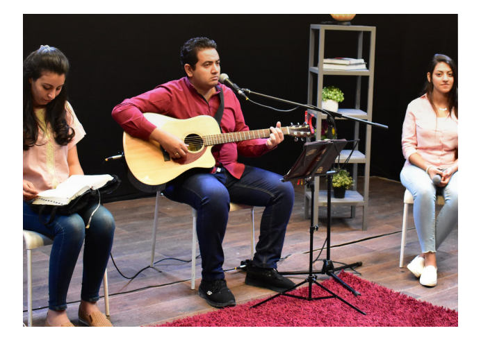
Rehearsals ahead of praise and worship programme As in Heaven at SAT-7 Egypt's studio

Give thanks for the work of the licensing committee; pray that churches will continue to be approved and this will reduce hostility towards the Christian community. Pray for an end to the violence that churches are sometimes subjected to so that believers feel able to meet and worship without fear.