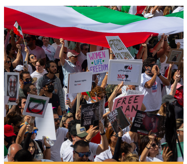
In 2022, protests broke out across Iran and spread to other parts of the world. Here, protesters in the U.S. take to the streets.

Pray for peace and justice for Iranians, and that restrictions on freedoms there will be lifted.