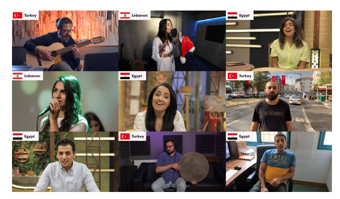
SAT-7's international recording of Silent Night - available on the Advent resources page

Find free family, group and church resources for Advent at sat7uk.org/advent-resources