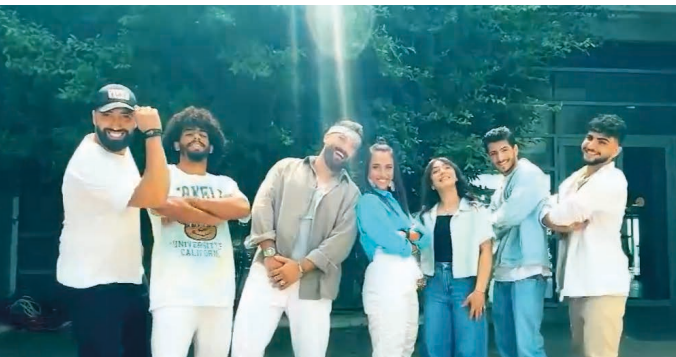
The presenters of SAT-7 KIDS show Jesus is My Strength