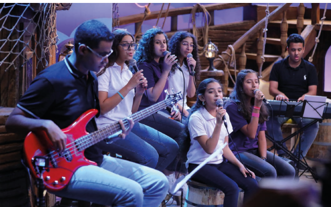
Above: SAT-7 KIDS praise and worship show My Jesus

SAT-7 KIDS programme My Jesus (pictured below) reveals the character of Christ to children through worship songs and reflections, helping them know Jesus personally and follow the example He set. Pray for all of SAT-7's programmes that share the Gospel with children, that God will use them to brighten the future of the MENA.