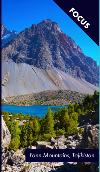
Fann Mountains, Tajikistan

God's creation is full of wonders and marvels, but for those lacking safety and security, the natural world can feel like more of a foe than a friend. As Earth Day is celebrated today around the world, pray for MENA Christians to experience a restored relationship with the Creator and His creation.